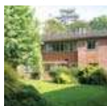
EF International House

EF International House: onsite multi rooms for 60GBP/week with basin in room, some shared facilities, some ensuite. Half board in school cafeteria. Several onsite dormitories make up this residential campus community. Single rooms for £110/week. During peak summer weeks some offsite residence options may be offered.